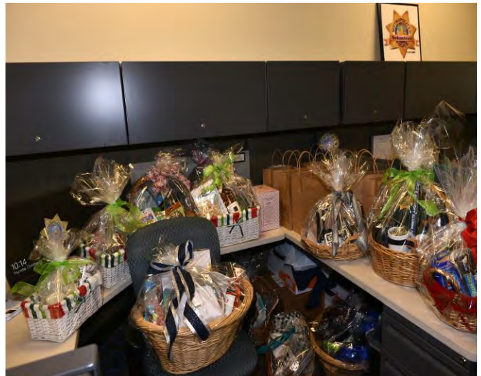
THESE LOOK GREAT TEAM!