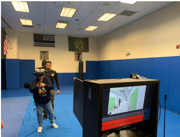
Sandy sees her suspect as shown on the monitor.