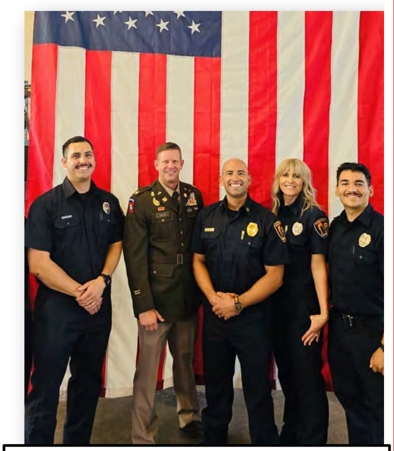
CAPTAIN VIRTUOSO AND HIS CREW LOOK FORWARD TO HOSTING THE CPAAA

GET READY TO BID ON DEC. 5, 2024: 10 SPACES AVAILABLE TO BE HELD AT: