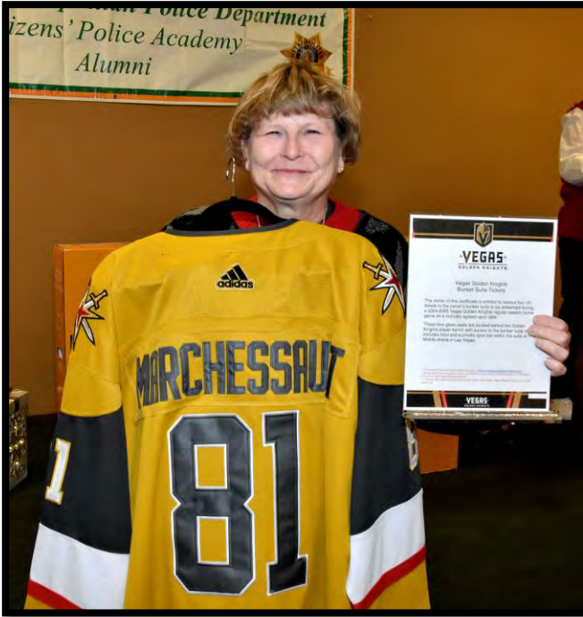
VGK HERE I COME