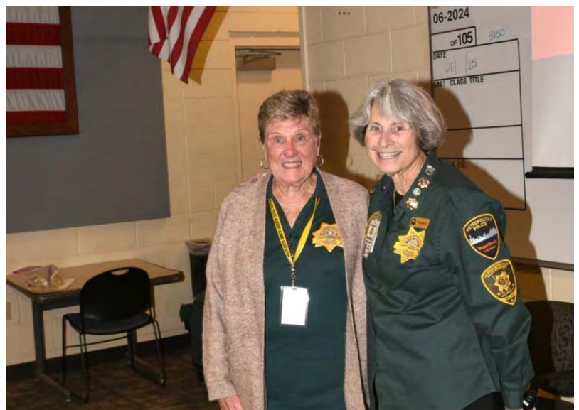
WANDA WAS SURPRISED BY THE ANNOUNCEMENT