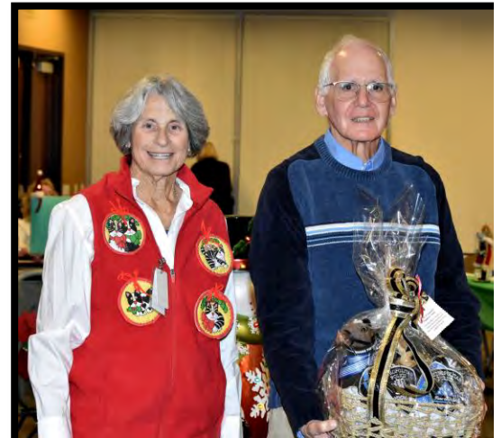
FIRST RAFFLE WIN EVER