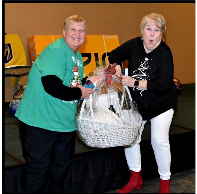
IT IS GOOD TO HAVE HELP FROM MY FRIEND