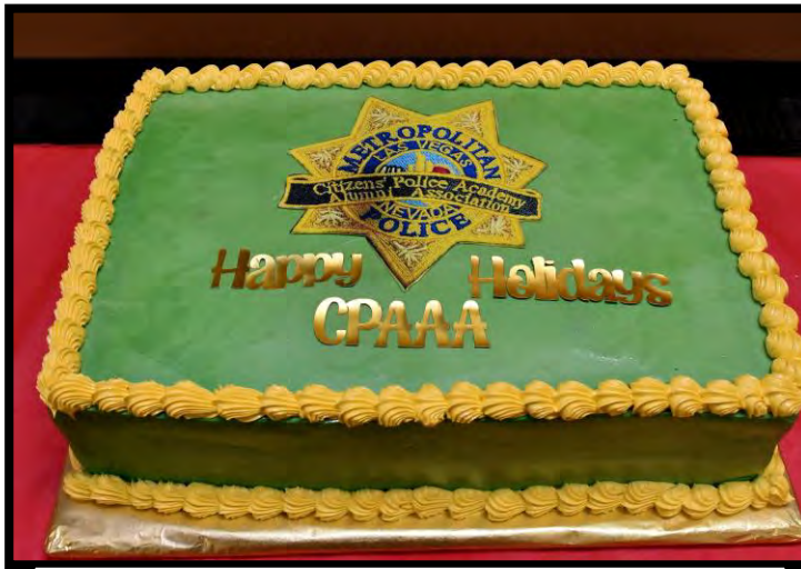
IT WAS DELICIOUS TOO!