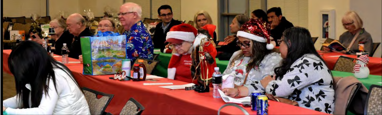
MANY NEW FACES THIS YEAR ATTEND THE FUNDRAISER