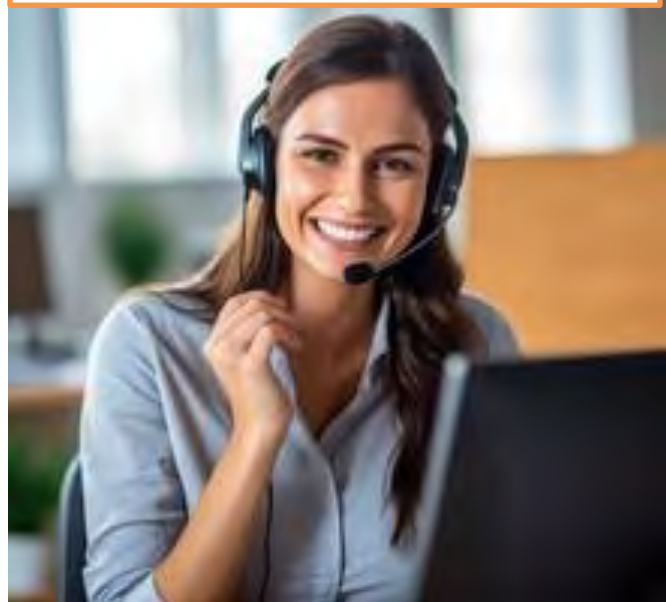
CALL CENTER OPERATOR

PLEASE BE AT THAT MEETING TO GET THE EARLIEST TIME SLOTS. THERE ARE ONLY A FEW SLOTS PER SHIFT.