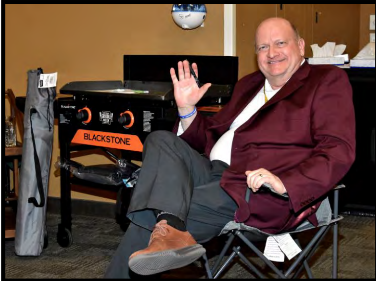
GRILLING IS MY GAME