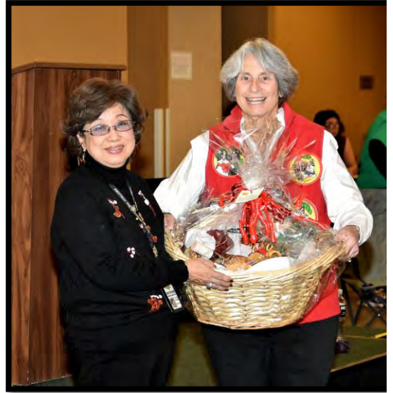
JUST WHAT I WANTED