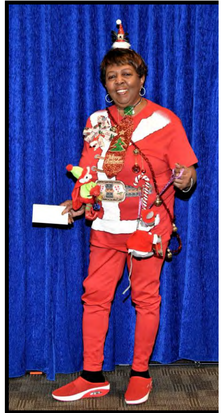
UGLY SWEATER WINNER