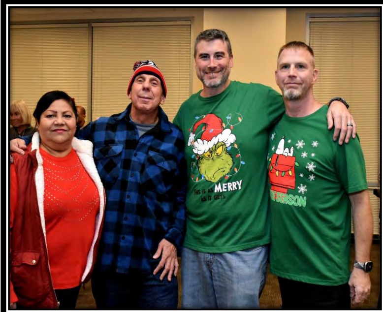
CHRISTMAS SPIRIT TOGETHER