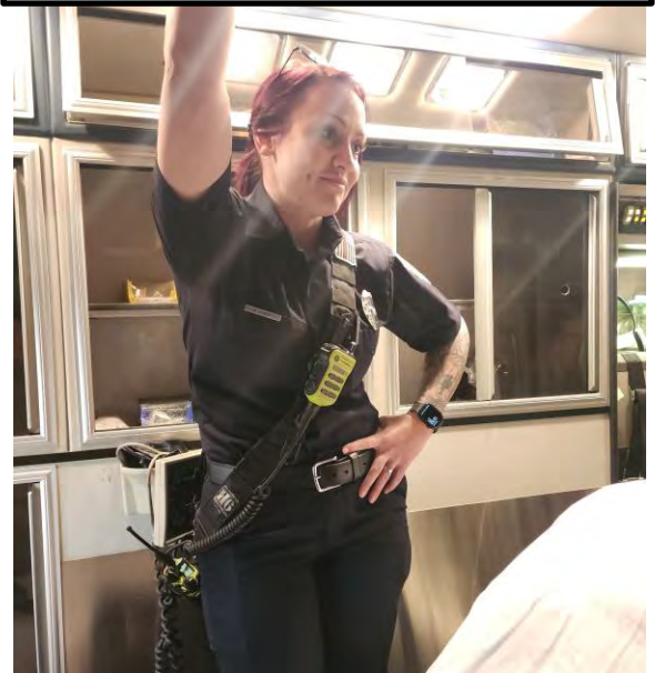
Everyone Goes Home